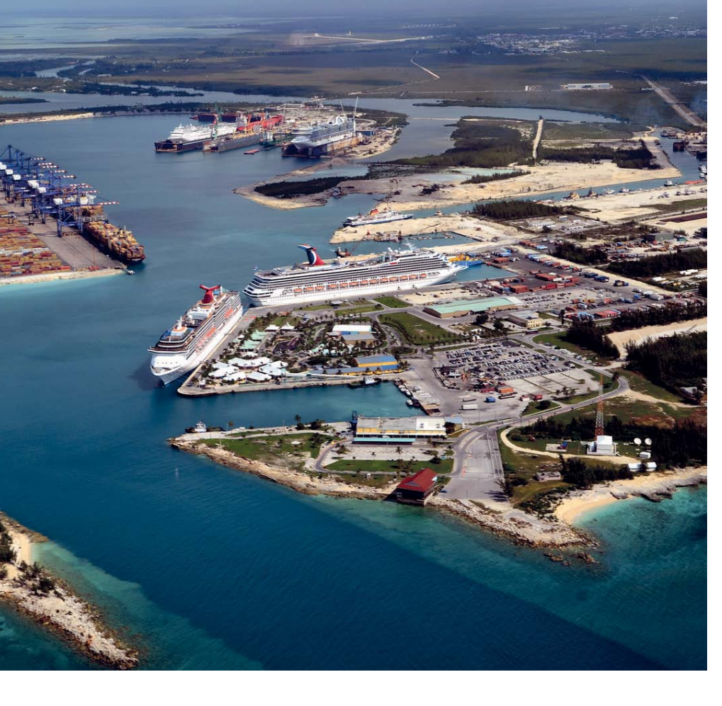
Aerial view of both the FCP and the cruise ship terminal. Below: The Group's only airport is at Grand