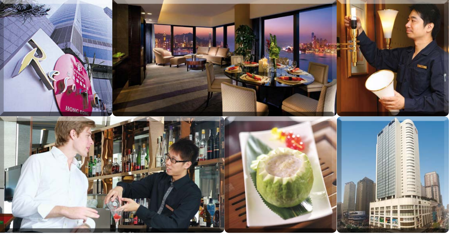
The "can do" attitude provides a home from home experience that excels "beyond the call of duty".