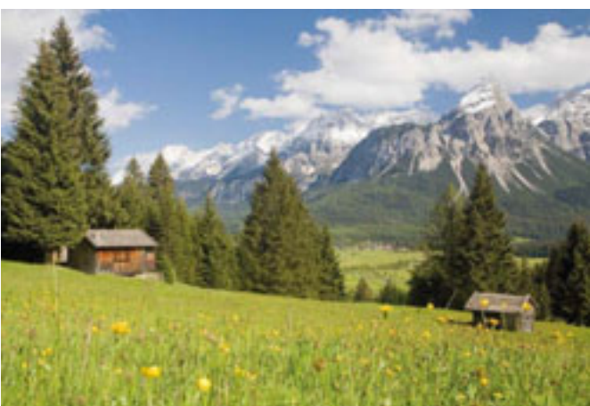
(Above) The Skyline of Vienna. (Bottom Left and Right) Winter and summer alpine scenery.

In spite of its small size, Austria has a rich and noble history and used to have strong influence around the world. Once the centre of power in Europe during the time of Austro-Hungarian Empire from 1867 to 1918, this great empire included the entire territories of modern day Austria, Hungary, the Czech Republic, Slovakia, Slovenia, Croatia, Bosnia and parts of Serbia, Romania, Ukraine, Poland and Italy. This German-speaking country was also the centre of the World War I, which was triggered by the assassination of Austrian Prince Archduke Franz Ferdinand in 1914. Today, the nation is a parliamentary representative democracy, and has been a member of the United Nations since 1955.