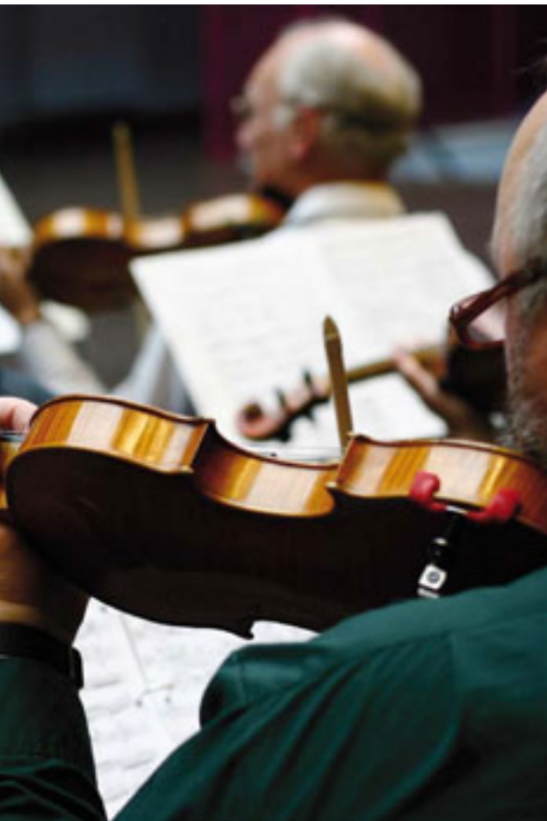
Rich in culture, Vienna is a capital of classical music with the Vienna Boys' Choir bringing the finest choral music to the world.