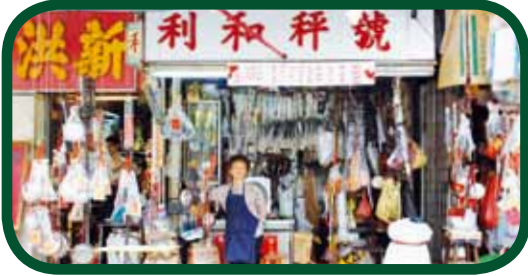
Hong Kong's small businesses house a unique neighbourhood culture.