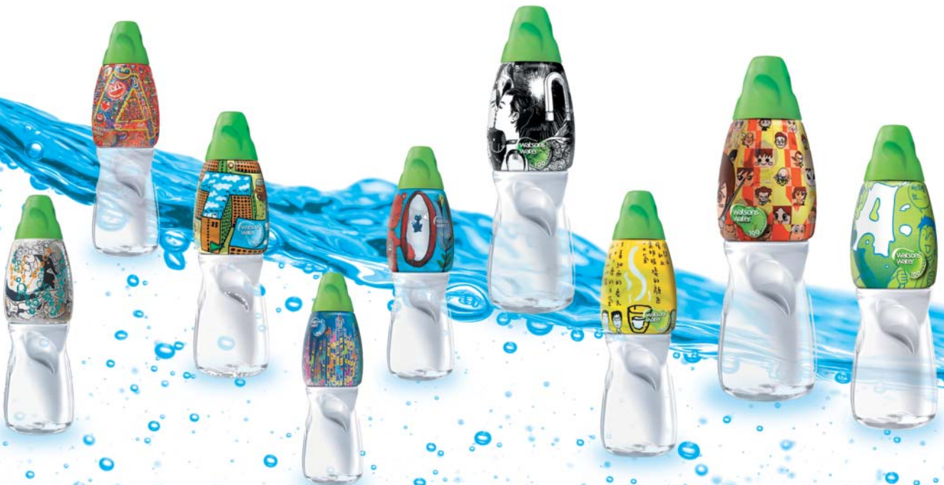
To celebrate its centenary, the work of well-known local artists is being featured on the Watsons Water bottle labels throughout 2003.