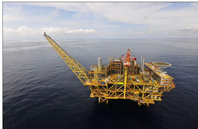
Liwan Central Platform

Liwan has taken approximately seven years from discovery to first production and is considered one of the fastest developments in the world for a large-scale gas project in deep water.