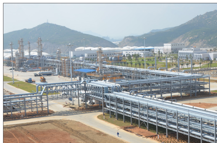
Gaolan Gas Terminal