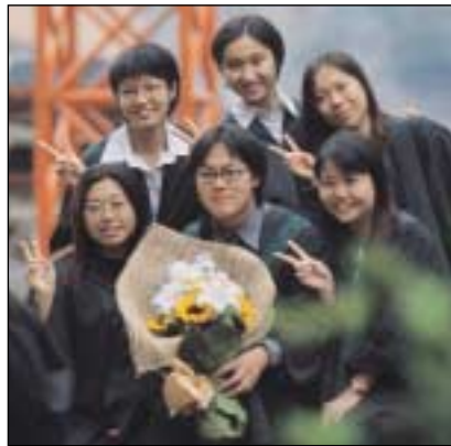
Students will benefit from the new facilities.

The naming came in recognition of a HK$100 million (approximately US$12.8 million) donation made by the Li Ka-shing Foundation in support of the University's mission to achieve "academic excellence in a professional context". The building provides a total