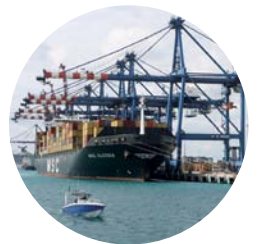
The Freeport Container Port in the Bahamas:

In 1995, HWL entered into a 50-50 partnership with the Grand Bahama Development Company to develop the Freeport facility. Freeport Container Port (FCP) commenced operations in 1997. It is located on Grand Bahama Island about 100 miles from the port of Miami, Florida. After the completion of the USD83 million Phase IV Development in 2004, FCP now has 1,036 metres of berth length with 16 metres of depth alongside. It contains 57 hectares of stacking area and capacity to handle 1.5 million TEUs per year. It is the deepest container terminal in the region and is a major container transshipment hub.