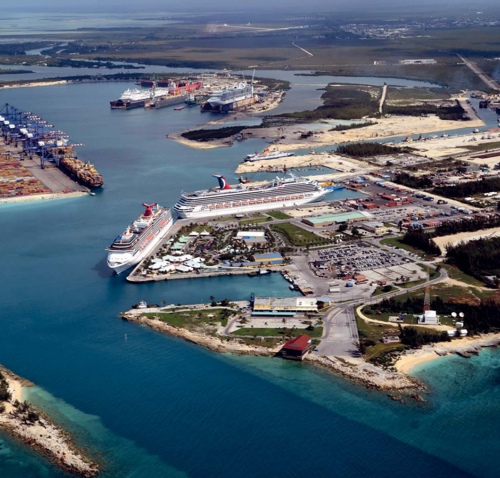
Aerial view of both the FCP and the cruise ship terminal.