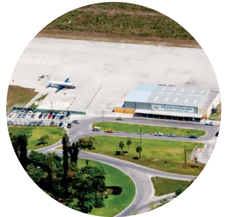
Below: The Group's only airport is at Grand Bahama.

the Caribbean region. The same is true for the Bahamas, especially this island of Grand Bahama.