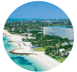
Grand Lucayan the largest resort property in the Bahamas

T he Bahamas, with a population of fewer than 400,000 people, have some of HWL's most interesting ventures. On the Island of Grand Bahama, where Hutchison Port Holdings operations are, the population is even tinier - only 52,000. Nonetheless, HWL has a surprisingly diverse range of businesses including ports, hotels, a cruise ship terminal and even the Group's only airport.